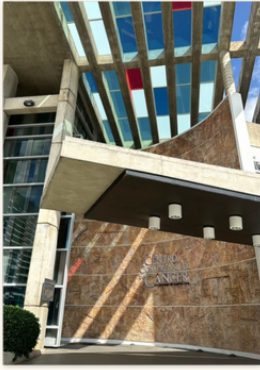
ELIANA BURGOS (MS2)