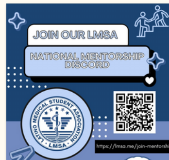
Join LMSA Nationals Mentorship Discord