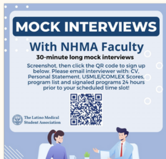
LMSA Mock interviews with NHMA faculty