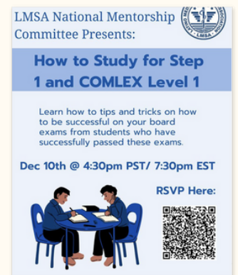
LMSA National Mentorship Committee Presents: How to Study for Step 1