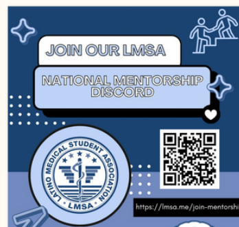
Join LMSA Nationals Mentorship Discord