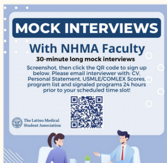
LMSA Mock interviews with NHMA faculty