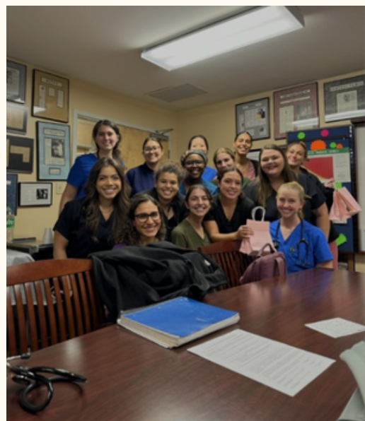
JUDEO-CHRISTIAN CLINIC NIGHT