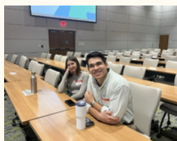
HORNS FOR HEALING